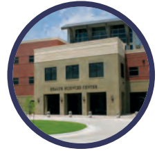
Health Sciences Center @ Lemley Memorial Campus 3350 S. Memorial Dr.