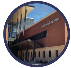
Client Service Center @ Lemley Memorial Campus 3638 S. Memorial Dr.