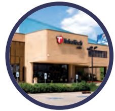
Peoria Campus 3850 N. Peoria Ave.