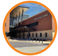
Client Service Center @ Lemley Memorial Campus 3638 S. Memorial Dr.