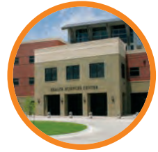
Health Sciences Center @ Lemley Memorial Campus 3350 S. Memorial Dr.