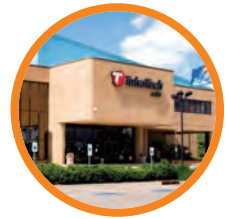
Peoria Campus 3850 N. Peoria Ave.