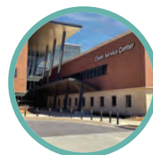
Client Service Center @ Lemley Memorial Campus 3638 S. Memorial Dr.