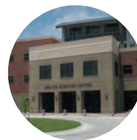
Health Sciences Center @ Lemley Memorial Campus 3350 S. Memorial Dr.