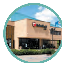
Peoria Campus 3850 N. Peoria Ave.