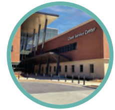
Client Service Center @ Lemley Memorial Campus 3638 S. Memorial Dr.