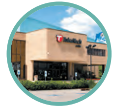
Peoria Campus 3850 N. Peoria Ave.