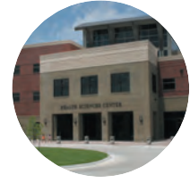
Health Sciences Center @ Lemley Memorial Campus 3350 S. Memorial Dr.